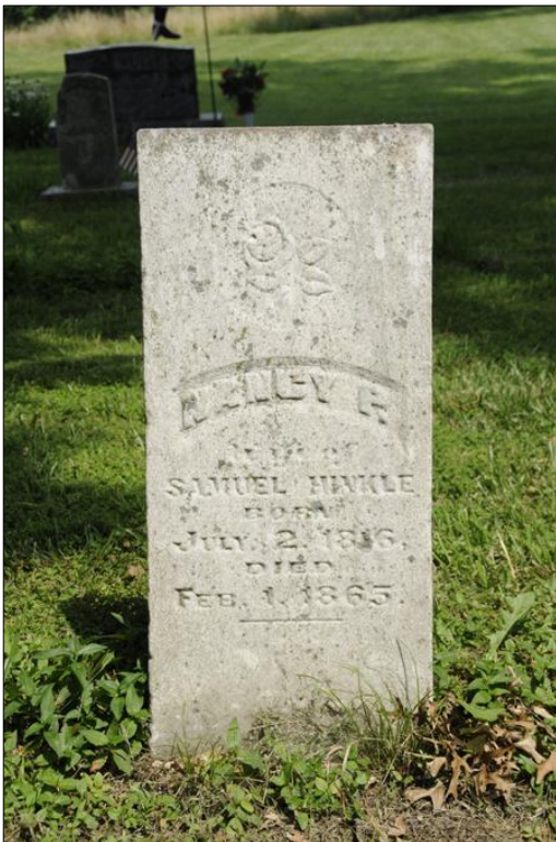
Nancy P./Wife of/Samuel Hinkle/Born/July 2, 1816/Died/Feb. 1, 1865

The Hinkle-Wolfe Cemetery is a small, beautiful, remote cemetery located on Frog Pond road north of Steelman Chapel Road. Frog Pond road is a dirt road and is not accessible when wet. The cemetery is very well maintained. It contains the grave of Nancy Cowan Hinkle, wife of Samuel Hinkle and mother of Lavica Hinkle the second wife of George E. Field.