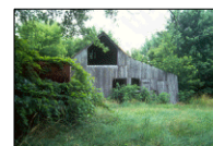
Barn on Military Donation No. 10