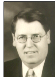
Harvey Oliver Field